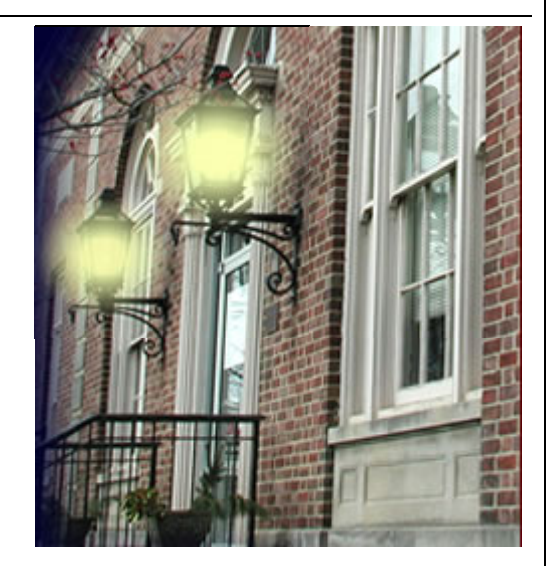
Picture: Front steps of Hardin County Museum http://www.hardinkyhistory.org/aboutus.htm

The Hardin County History Museum opened its doors in 2003. The museum houses artifacts, documents, and other memorabilia that tells the interesting history of Hardin County. At the museum, you will find permanent exhibits as well as some that rotate and change from time to time with different events. Pioneer relics form a collective memory of cabin life in the wilderness of the Kentucky frontier. Various panels depict the evolution of the counties carved from the frontier of Kentucky County, Virginia that became a state in its own right and settled by the influx of westward travelers after the War of Revolution. The most recent addition to the museum is a Lincoln room with interesting information about our nation's sixteenth President. More than 200 years after gathering and preserving began in Hardin County; we are still gathering and preserving our history for the generations to come.